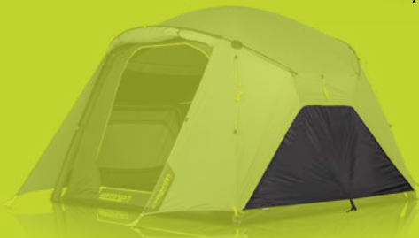
Aerospeed 4 Wall Set