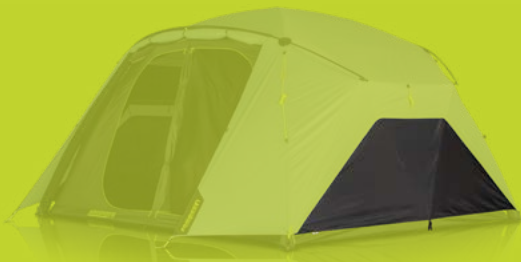
Aerospeed 10 Wall Set