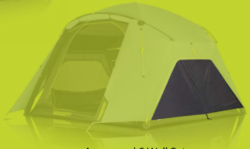
Aerospeed 6 Wall Set